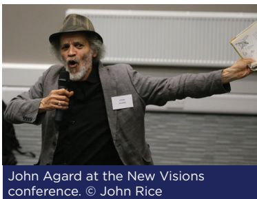
John Agard at the New Visions conference.